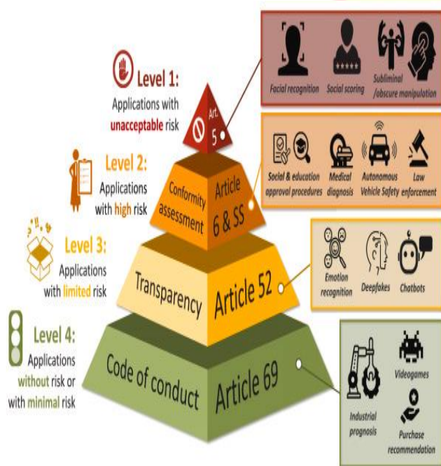
Fig2: Connecting the dots in trustworthy Artificial Intelligence

However, the deployment of automated enforcement systems raises ethical questions, such as bias in algorithms, lack of transparency in decision-making, over-censorship, and lack of accountability. Examples like YouTube's automated demonetization of videos and Facebook's moderation errors show that it is challenging to rely entirely on automated systems. It is very important to make sure that these systems work ethically in order to retain user trust and platform integrity.