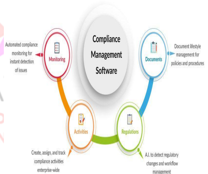
Fig1:Regulatory Compliance in Finance,(Source[1])

With the increasing scrutiny on social media platforms for regulatory compliance, the need for scalable and robust frameworks has been felt acutely. This manuscript discusses the design of scalable platforms that effectively integrate mechanisms for regulatory compliance. We identify best practices in compliance management on social media by examining the contemporary literature, implementing simulation research, and performing statistical analysis. The study highlights the role of technology, governance, and adaptability in addressing the multifaceted challenges of compliance, offering actionable insights for platform designers and policymakers.