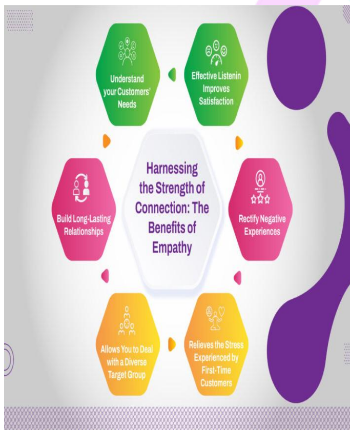
Fig2: The Benefits of Empathy, (Source[2])

However, despite its importance, the integration of empathy in product design is often underemphasized or misunderstood. Many design teams focus solely on technical specifications, overlooking the emotional and experiential aspects of user interaction. This study explores the role of empathy in enhancing product design, aiming to provide actionable insights for incorporating empathetic practices into the design process.