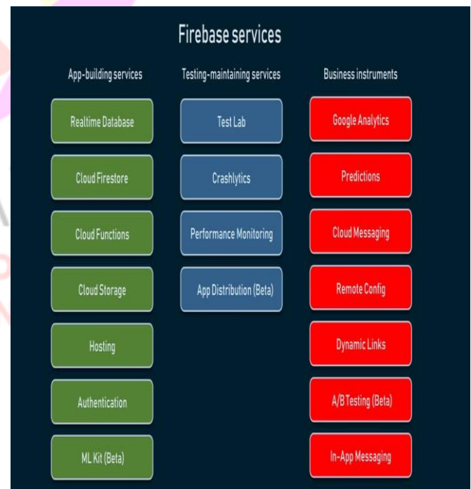
Figure-1. Firebase Services, Source[1]

This study investigates the potential of Firebase as a secure and scalable database solution for modern application development. Firebase, a comprehensive cloud platform developed by Google, offers a real-time database service, cloud storage, and an integrated suite of tools for building mobile and web applications. The research examines Firebase's security protocols, scalability features, and performance under varying loads using simulation methods. By combining literature review, methodological design, statistical analysis, and simulation research, the study demonstrates Firebase's capabilities and limitations in comparison with traditional database solutions. Findings indicate that Firebase provides robust security measures and scalability; however, it also faces challenges in areas such as vendor lock-in and cost management in high-load scenarios. Recommendations are provided for developers and organizations aiming to integrate Firebase into their technology stacks while mitigating potential issues.