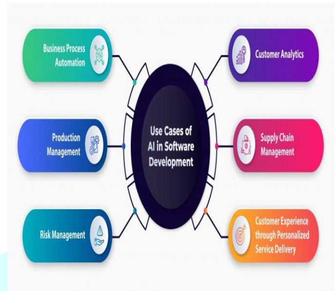
Figure-2. Use Cases of AI in Software Development

Historically, software development has relied on human intuition and manual testing to ensure code quality. However, as software projects grow in size and complexity, the likelihood of human error increases. AI and ML offer a promising solution by learning from vast amounts of data to detect patterns and anomalies that may not be readily apparent to human developers. Tools powered by machine learning can analyze codebases to suggest improvements, predict potential errors, and even write code snippets automatically. Moreover, project management can benefit from AI by forecasting deadlines, allocating resources optimally, and managing risk more effectively.