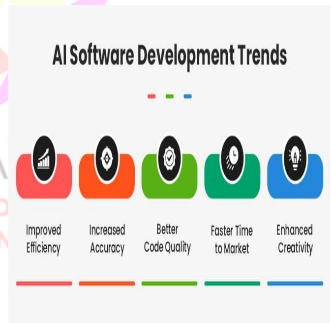
Figure-1. AI Software Development Trends. Source[1]

Software development has witnessed significant transformations with the advent of artificial intelligence (AI) and machine learning (ML). This manuscript explores how integrating AI and ML into software development processes can dramatically enhance efficiency, reduce error rates, and optimize development cycles. We discuss historical challenges in traditional software development, review recent literature highlighting successes in AI-driven methodologies, and present a statistical analysis comparing traditional and AI-enhanced approaches. The study includes a detailed methodology outlining the integration of AI tools in debugging, code generation, testing, and project management. Our results indicate that AI and ML techniques lead to a measurable improvement in productivity and quality assurance. The manuscript concludes by addressing potential limitations, ethical concerns, and future directions for research, ultimately advocating for broader adoption of these technologies to meet evolving industry demands.